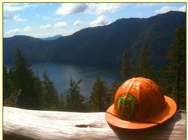
Photo taken by Colin Chambers (Class of '07) while Bull Bucking on Prince of Wales Island in Alaska for Columbia Helicopters.

A picture says a thousand words. This fantastic photograph taken by Colin Chambers in Alaska last year doesn't need many more words. Working with a Columbia helicopter crew, Chambers has been able to work in 7 different states in just one year!